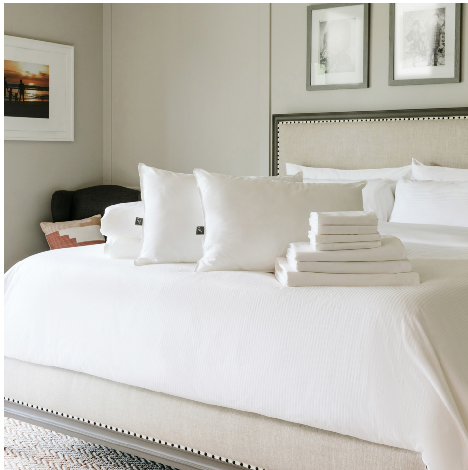
Rest easy in the elegant comfort of a Fairmont Signature Sleep Experience